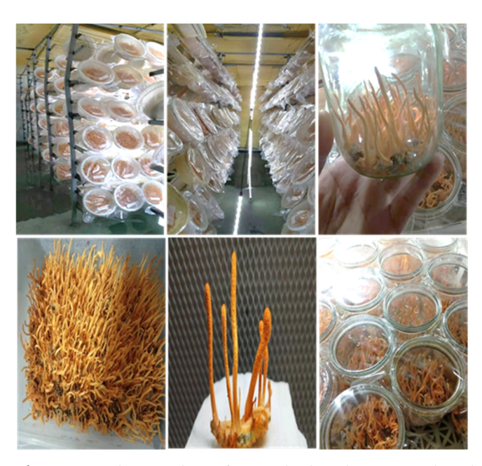
Figure 1. Cordyceps militaris fruiting body cultivation-Shanghai.

The analysis of the data obtained shows that in IM1 medium, the amount of fresh fruit body obtained represents 35% relative to the feedstock, the mycelial culture represents 92.5% relative to the feedstock, and the total amount of feedstock for the production of extracts represents 127.5% relative to the feedstock.